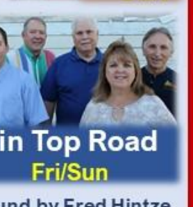
Tin Top Road Fri/Sun