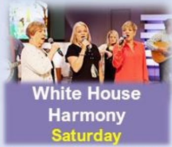
White House Harmony Saturday