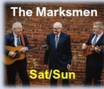
The Marksmen Sat/Sun