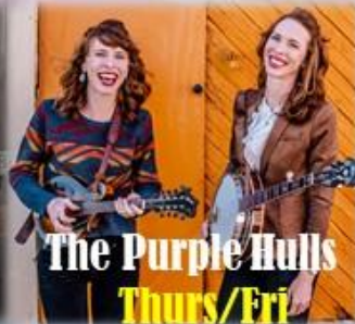
The Purple Hulls Thurs/Fri