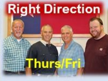
Right Direction Thurs/Fri