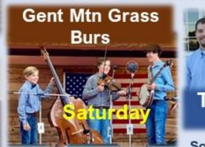
Gent Mtn Grass Burs Saturday