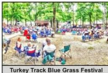
Turkey Track Blue Grass Festival

Shows Start at 1:00 PM and 6:30 PM Except Wed. - First Show at 6:30 PM