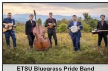
ETSU Bluegrass Pride Band