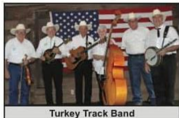
Turkey Track Band